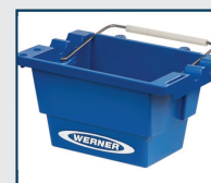
JOB BUCKET Model AC50-JB-3