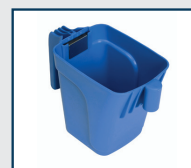
PAINT CUP Model AC27-P