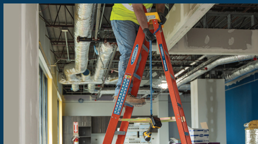
Three position anchor points prevent tools from accidentally falling while working at height