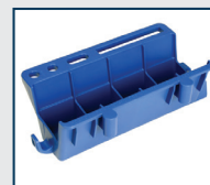
JOB CADDY Model AC54-JC