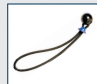
TOOL LASSO Model AC58-TL

*All LOCK-IN™ Accessories sold separately.