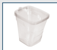
PAINT CUP LINER Model AC27-L

Ask your Sales Representative for details and availability.