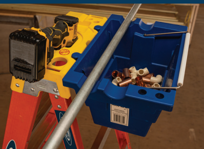
LOCK-IN™ accessory system secures tools and expands ladder top