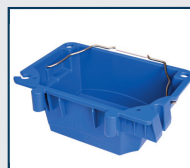
UTILITY BUCKET Model AC52-UB