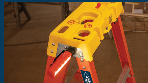
Metal plate holds magnetic accessories like flashlights & laser levels