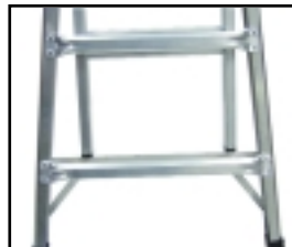
Extra wide flared bottom for firm support

Adjust angle position easily with soft touch push knobs