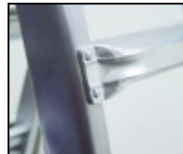
Double riveted steps for long lasting durability