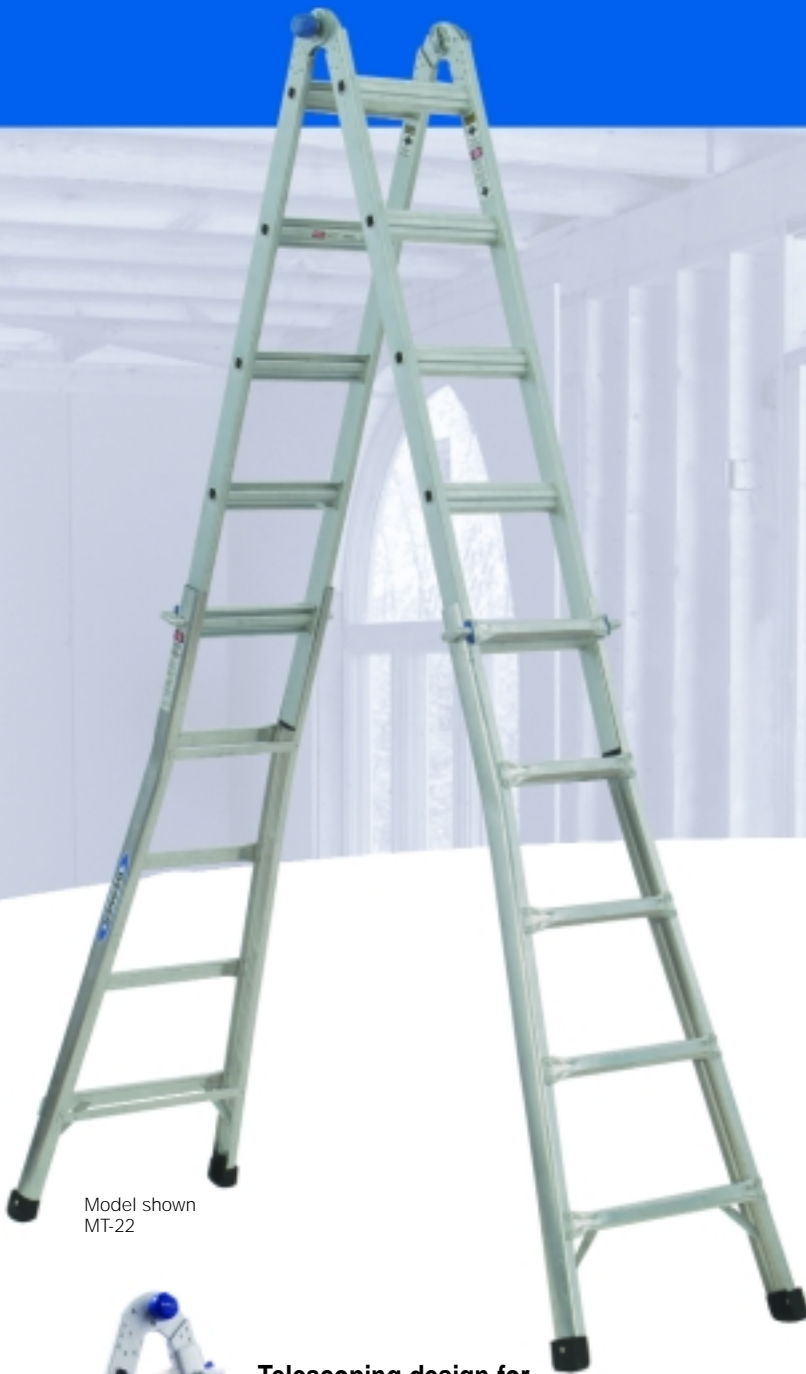
Model shown MT-22