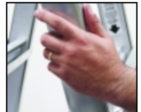
Smooth curved rails for comfortable climbing