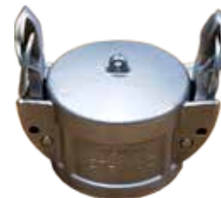
DUST CAP TYPE DC