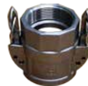
FEMALE COUPLER X FEMALE NPT TYPE D