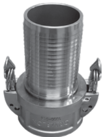
FEMALE COUPLER X HOSE SHANK TYPE C