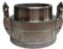
FEMALE COUPLER X MALE NPT TYPE B

Designed for use with Buchanan Crimp Sleeves and Interlocking Ferrules