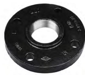
DUCTILE IRON THREADED FLAT FACED COMPANION FLANGES