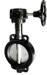
NICKLE PLATED DUCTILE IRON DISC & SS DISC