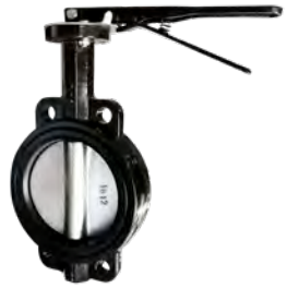
NICKLE PLATED DUCTILE IRON DISC & SS DISC