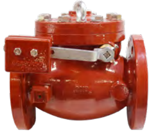
AND WEIGHT CHECK VALVES