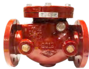
SWING CHECK FLANGED