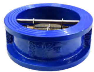
WAFER STYLE DOUBLE DOOR CHECK VALVE