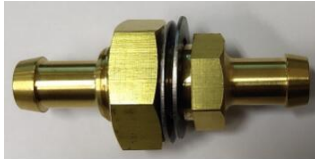
3/8HOSE X 3/8 HOSE Connection Total Length 2.46"