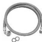
With 90° Elbow