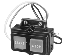
START-STOP Push Button kits