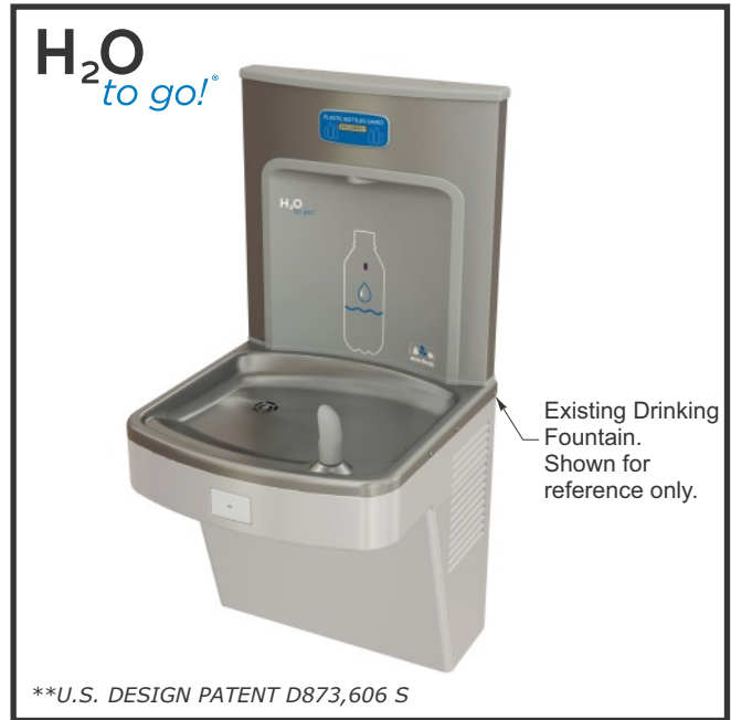
Model BF12-BCD Shown

Bottle Filler unit may be used on certain existing Murdock ® Manufacturing units or models which include Bottle Filler. Existing Drinking Fountain may require alteration for connection to Bottle Filler. Unit to include Sensor operated activation with a 20 second maximum run time. Housing construction to be heavy gauge stainless steel with a #4 satin finish and to include components manufactured from antimicrobial, impact resistant ABS. Bottle Filler shall provide approximately 1.0 GPM flow rate with a Laminar Flow Spout to minimize splashing. Optional -BCD (Bottle Counter Display) indicates the quantity of 16 oz disposable Plastic Bottles saved from a land fill. -BCD option displays the Water Filter Status and includes LED Light to illuminate and brighten the Bottle Fill area when a Bottle is detected. Optional -WF1 Water Filter meets NSF 42 and 53 requirements and reduces lead content in the drinking water by 99%.