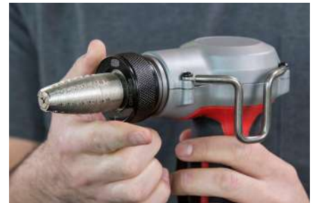
Power Expansion Tool - Not sold by Zurn