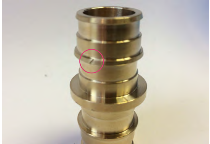
Damaged sealing barb, will not seal

Damaged, cut or grooved sealing barb will not seal.