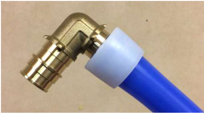
Improperly inserted fitting

Fitting is not inserted completely into expanded pipe/ring.