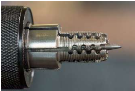
Zurn PEX Expansion Head - Sold by Zurn