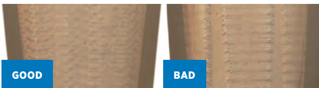
Cut away of PEX pipe after proper and improper expansion

This example shows that the expansion tool was not rotated between multiple expansions, leaving a groove or leak path past the fitting barb. This may also be caused by a damaged expansion head.