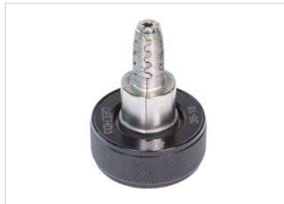
Zurn PEX Expansion Head - Sold by Zurn