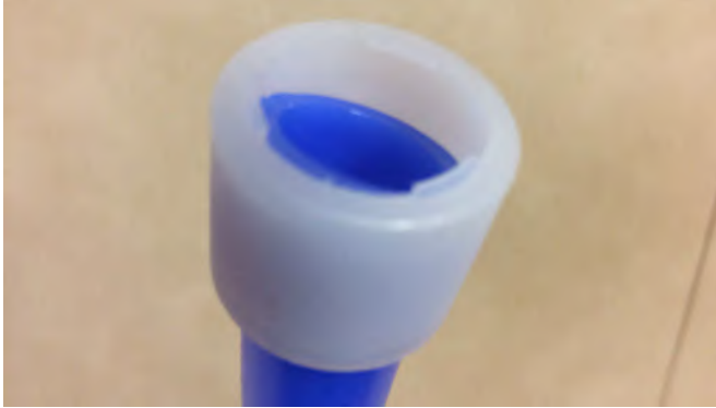
Pipe not cut squarely

If the pipe is not cut squarely, the ring and pipe will not be mated evenly and installed fully over F1960 barb for a viable seal.