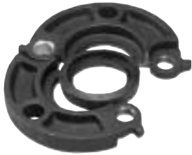
2 - 8" Sizes