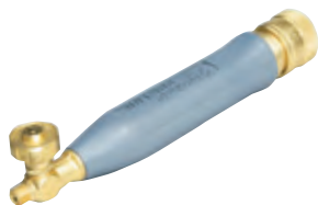
G4 TurboTorch® (0386-0308)