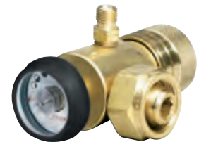
AR-B (0386-0725) AR-MC (0386-0726) AG-1 (0386-1200) (gauge only)