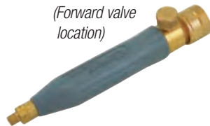
PLF-A5 Proline® (0386-0872)