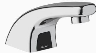
Image for a standard EBF-615 shown

Optima® Battery-Powered Deck-Mounted Low Body