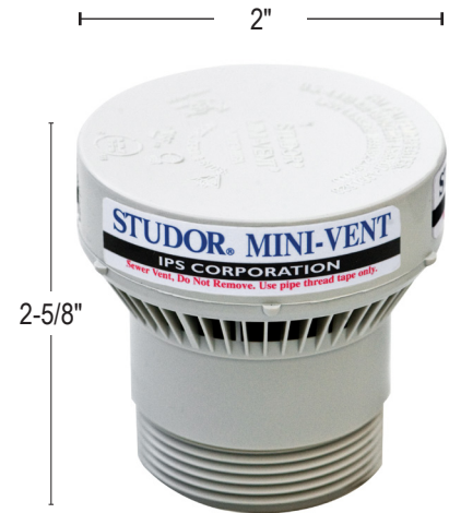
— Adaptor 1-1/2" NPT —