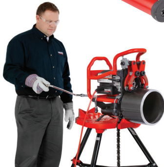
Beveller shown on TBM-36 Beveller Adapter (Cat. # 55023) for fixed bevelling.