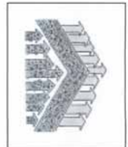
FIGURE 2 Rheem Media Filters