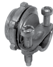
10 per bag