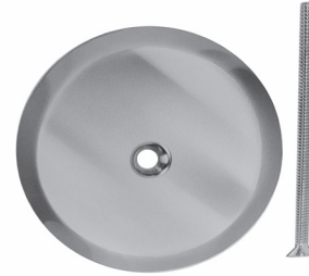
Cover Plate with 1/4" - 20 x 4" bolts