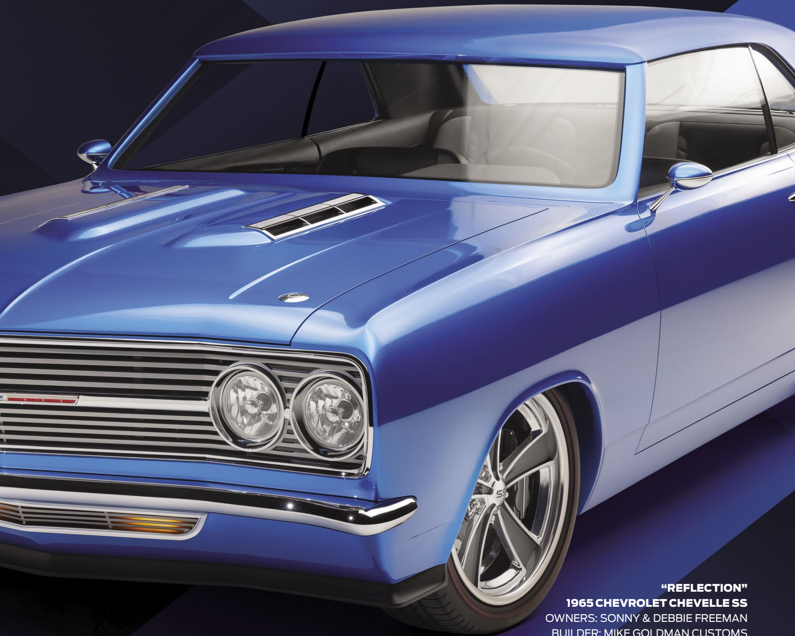
"REFLECTION" 1965 CHEVROLET CHEVELLE SS OWNERS: SONNY & DEBBIE FREEMAN BUILDER: MIKE GOLDMAN CUSTOMS