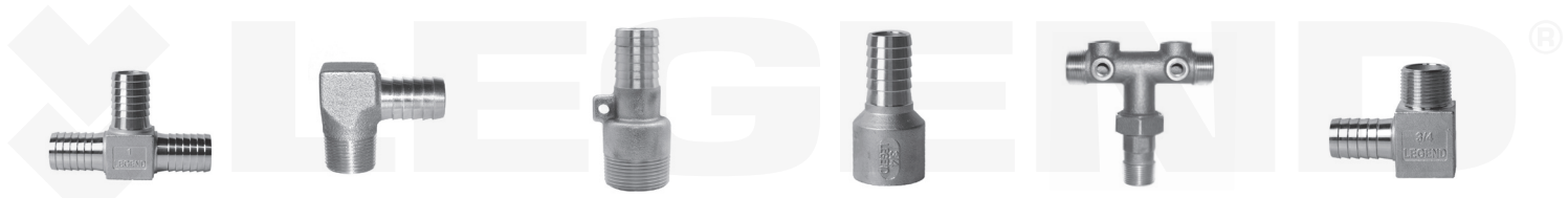
Stainless Steel Insert Tee