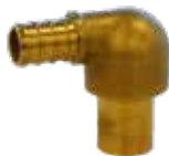
PEX x Fitting Elbow

ASTM F1807 No lead, DZR forged brass ANSI/NSF 61 & 14