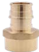
PEX x FNPT Reducing Adapter

ASTM F1960 No lead, DZR forged brass ANSI/NSF 61 & 14