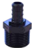
PEX x MNPT Adapter