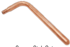
Copper Stub Out