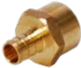
PEX x FTG Adapter

ASTM F1807 No lead, DZR forged brass ANSI/NSF 61 & 14