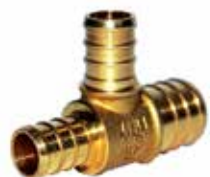
PEX Reducing Tee

ASTM F1807 No lead, DZR forged brass ANSI/NSF 61 & 14