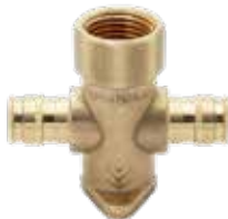
PEX x FNPT Tee

ASTM F1960 No lead, DZR forged brass ANSI/NSF 61 & 14