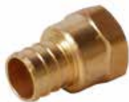
PEX x FNPT Adapter

ASTM F1807 No lead, DZR forged brass ANSI/NSF 61 & 14