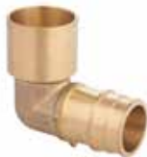
PEX x Sweat Elbow

ASTM F 1960 No lead, DZR forged brass ANSI/NSF 61 & 14