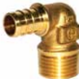
PEX x MNPT Elbow

ASTM F1807 No lead, DZR forged brass ANSI/NSF 61 & 14