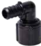
PEX x FNPT Swivel Elbow