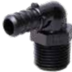
PEX x MNPT Elbow