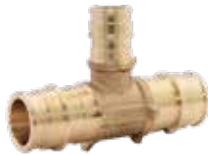
PEX Reducing Tee

ASTM F1960 No lead, DZR forged brass ANSI/NSF 61 & 14