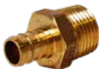
PEX x MNPT Adapter

ASTM F1807 No lead, DZR forged brass ANSI/NSF 61 & 14