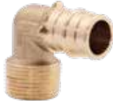
PEX x MNPT Reducing Elbow

ASTM F1960 No lead, DZR forged brass ANSI/NSF 61 & 14