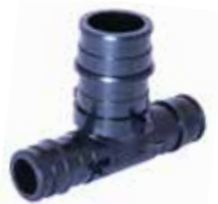
PEX Reducing Tee