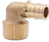
PEX x MNPT Elbow

ASTM F1960 No lead, DZR forged brass ANSI/NSF 61 & 14