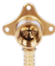
Drop Ear Elbow

ASTM F1807 No lead, DZR forged brass ANSI/NSF 61 & 14