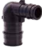
PEX Reducing Elbow