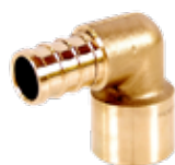
PEX x Sweat Elbow

ASTM F1807 No lead, DZR forged brass ANSI/NSF 61 & 14