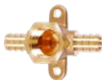
Drop Ear Tee

ASTM F1807 No lead, DZR forged brass ANSI/NSF 61 & 14