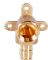
F1960 PEX x FNPT

ASTM F1960 No lead, DZR forged brass ANSI/NSF 61 & 14