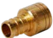
PEX x Sweat Adapter

ASTM F1807 No lead, DZR forged brass ANSI/NSF 61 & 14