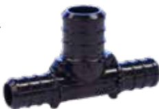
PEX Reducing Tee