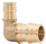
PEX Reducing Elbow

ASTM F1960 No lead, DZR forged brass ANSI/NSF 61 & 14