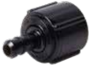
PEX x FNPT Swivel Adapter