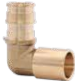
PEX x Fitting Elbow

ASTM F1960 No lead, DZR forged brass ANSI/NSF 61 & 14