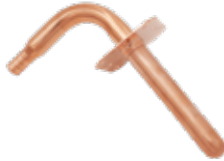
Copper Stub Out with Flange