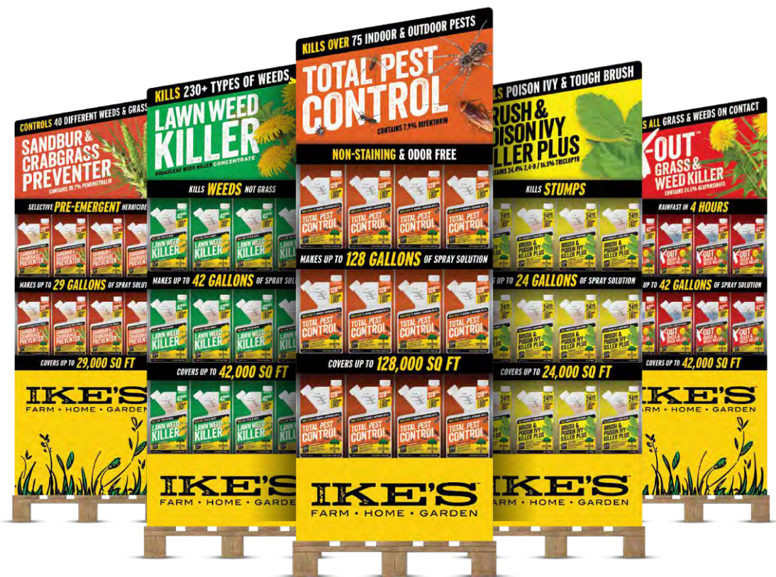
Product-Specific Displays available in 48-count and 72-count