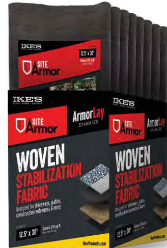
Folded Fabrics Sold in Case Packs