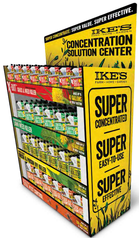
192-Count Solution Center Display