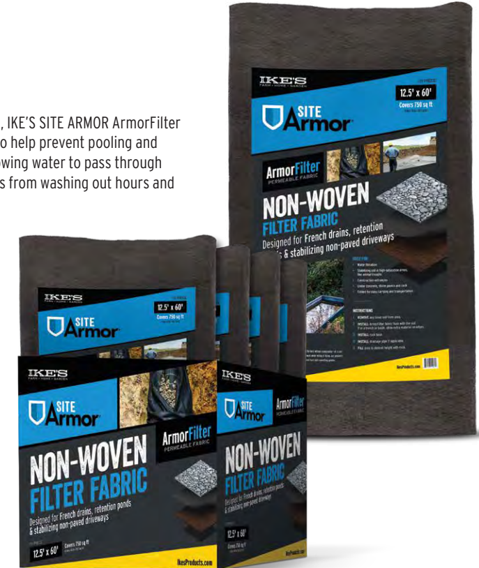
Sold in Case Packs