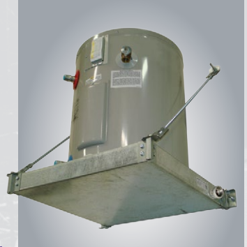
30-SWHP-WM, 40-SWHP-WM 50-SWHP-WM, 60-SWHP-WM