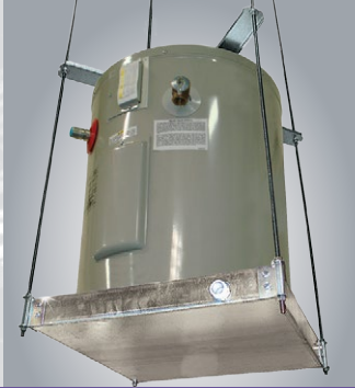
40-SWHP, 50-SWHP, 60-SWHP