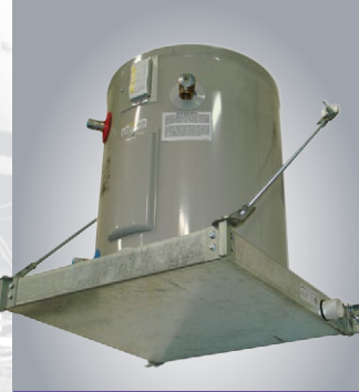
40-SWHP-W, 50-SWHP-W 60-SWHP-W