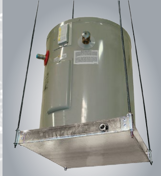
30-SWHP-M, 40-SWHP-M 50-SWHP-M, 60-SWHP-M