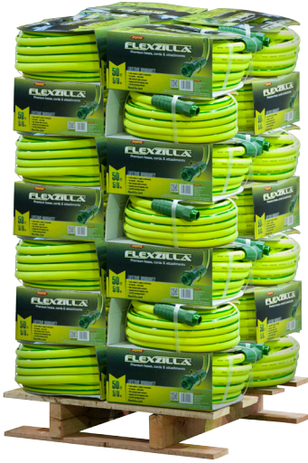
Hose FEATURES - See Page 2