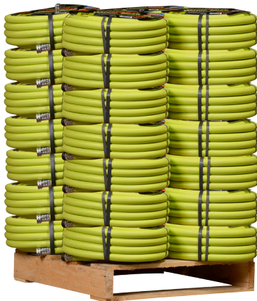
Hose FEATURES - See Page 10