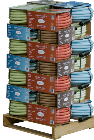
Hose FEATURES - See Page 12