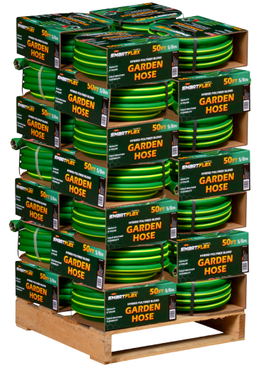
Hose FEATURES - See Page 11