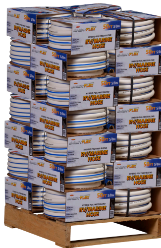
Hose FEATURES - See Page 11