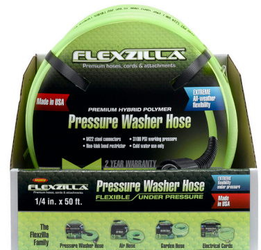
Hose FEATURES - See Page 7