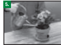
5. Water; let drain. Riegue; deje drenar.