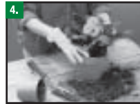
4. Add more mix; press lightly. Agregue más mezcla; presione ligeramente.