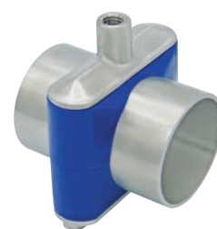
Hang Plate Block Hangers - B24-HP