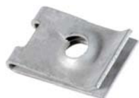
13162 (0712-9-925-720) Plated

U-Type Nut Screw Size: 5.6mm Panel Range: 1.2mm -2.0mm Center of Hole to Edge: 10mm