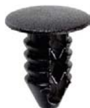
13198 (4-29-29-06) Black Nylon

Interior Trim Retainer Head Diameter: 16mm (41/64") Stem Diameter: 9mm (11/32") Stem Length: 18mm (11/16")