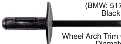
22147 (BMW: 51777171004) Black Nylon

Wheel Arch Trim Cover Nylon Rivet Diameter: 6mm Grip Range: 1.5mm - 10mm Flange Diameter: 20mm BMW X3, X4, X5 & X6 Series 2006 - On