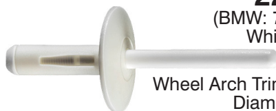
22131 (BMW: 7147391324) White Nylon

Wheel Arch Trim Cover Nylon Rivet Diameter: 6mm Grip Range: 1.5mm - 10mm Flange Diameter: 20mm BMW X5 2013 - On