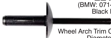
22146 (BMW: 07147293278) Black Nylon

Wheel Arch Trim Cover Nylon Rivet Diameter: 6mm Grip Range: 2.5mm - 10.75mm Flange Diameter: 20mm BMW X3, X4 & X5 Series 2010 - On