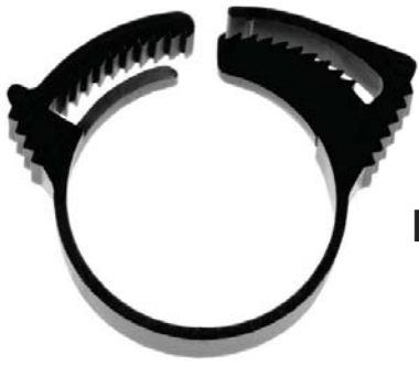
Single Bond Hose Clamps Black Nylon