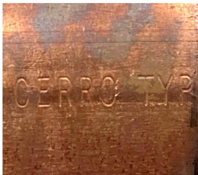
Figure 2 - Roll Stamped Tubing

Note: Tubing with stamping marks or scratches on the OD, as shown in figures 1 and 2, may cause leakage past the valve sealing element and should be avoided. Use of a fine grade sand cloth or Scotch-Brite™ pad can remove minor surface imperfections.