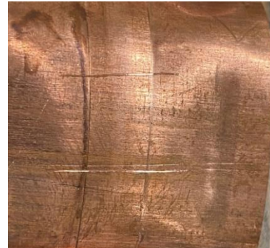
Figure 1 - Tube scratch damage