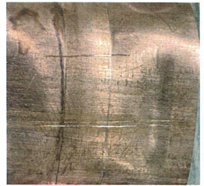
Figure 2 - Tube damage