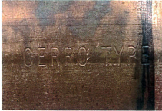
Figure 1 - Roll Stamped Tubing

Note: Tubing with stamping marks or scratches on the OD, as shown in figures 1 and 2, may cause leakage past the valve sealing element and should be avoided. Use of a fine grade sand cloth or Scotch-Brite™ pad can remove minor surface imperfections.