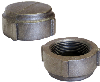
Fig. 381 Cap (Class 125 Standard)

Note: See Fig. 390 in Malleable Iron for other available sizes.