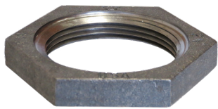
Fig. 370 Locknut (Class 125 Standard)