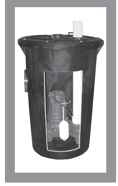
Products may not be exactly as pictured.

OPTIONS: Zoeller recommends a High Water Alarm for added protection. See FM0732 for available models