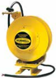
HBL501242W with HBL16PB