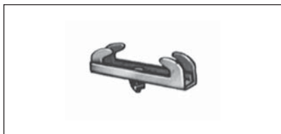
Includes bolts. Steel.