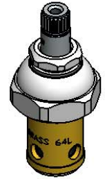
Cold Spindle (Assembled Item Shown for Clarity)