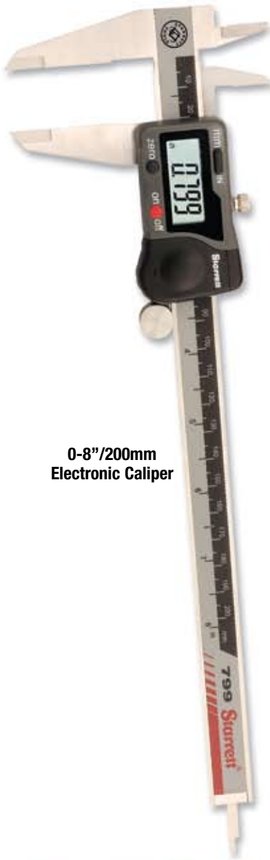
0-8"/200mm Electronic Caliper