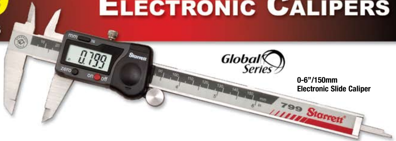
0-6"/150mm Electronic Slide Caliper

Starrett's 799 Series Electronic Calipers are light, comfortable, easy-to-use, and include features that have made Starrett Slide Calipers the machinist's first choice for many years.