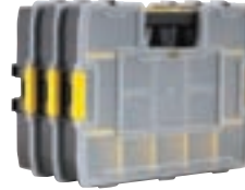
Can carry up to 3 together using latches