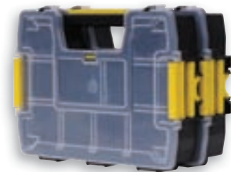
Additional latch for double sided stacking