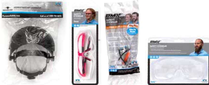
hang tag polybag