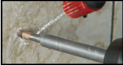
Easy Start Up & Rapid Penetration