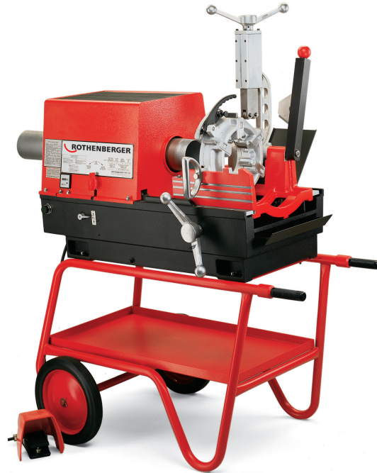
RHINO™ Threading Machine with optional wheeled stand