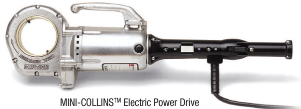
MINI-COLLINS™ Electric Power Drive