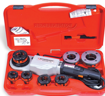
Rhino™, Collins™ and SUPERTRONIC™ are trademarks of Rothenberger AG.