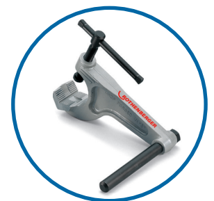
Forged pipe clamp, shown at right, is included with the P71259C SUPERTRONIC™ 2000 Power Threader Set.