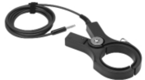
Inductive Signal Clamp

Use in conjunction with NaviTrack to locate trace wires, metallic waterlines, phone lines, cable TV lines, and other metallic lines.