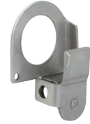
Push Button Lockout GO-10502