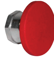
Jumbo Mushroom Momentary