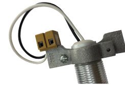
2 Pt. Terminal Block KIT-GOTB