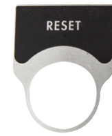
"GO" Legend Plate