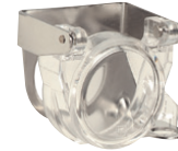
Selector Switch Lockout