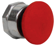
Standard Mushroom Momentary & Maintained