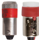
LED Lamp for GOB3/GOL3 - GOB4/GOL4