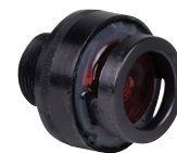
Lens Guard Assembly