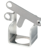
Push Button Lockout GO-8665