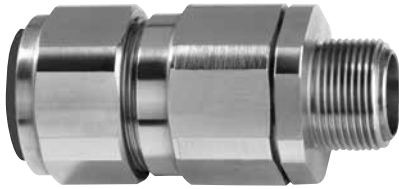
Dimensions in Millimeters (Inches)

Class I, Zone 1 Ex d IIC Gb Ex e IIC Gb Ex ta IIIC Da IP66, IP67, IP68