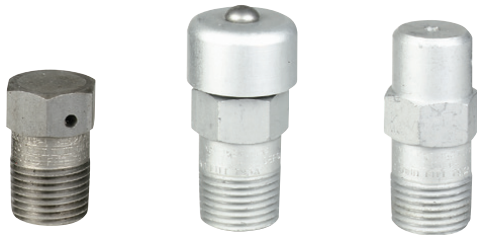
KDB-1 KB1B KB1D