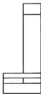
RL325A RAPID START LAMP HOLDER