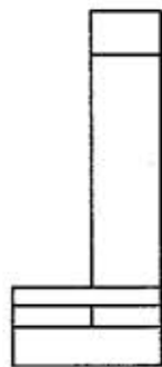
RL325 SCREW NOT SHOWN FOR CLARITY RAPID START LAMP HOLDER