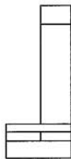
RL325B INSTANT START LAMP HOLDER