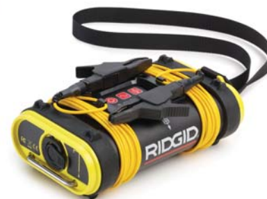
SeekTech ST-305 Line Transmitter