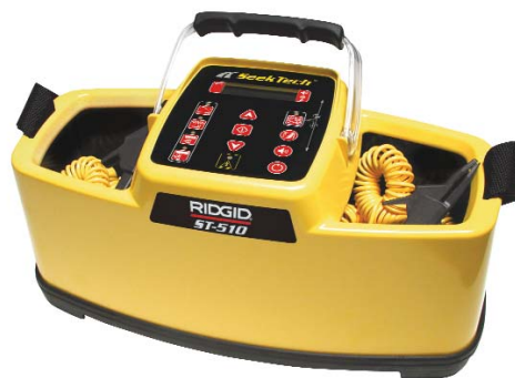
SeekTech ST-510 Line Transmitter