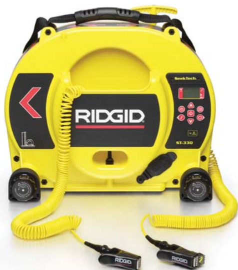
SeekTech ST-33Q Long Range Transmitter

Locating with RIDGID transmitters gives you the power and versatility to quickly and accurately trace underground lines, cables, and pipes!