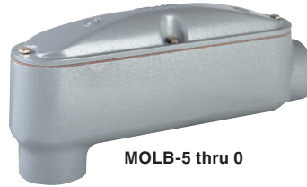
MOLB-5 thru 0