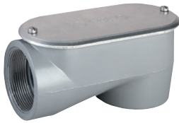
SLB-1 thru 7