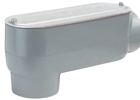
SOLB-8, 9, 0