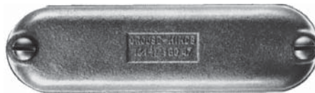
Feraloy® Iron Alloy