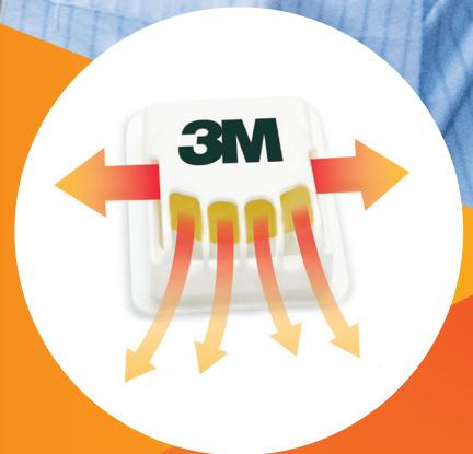
3M™ Cool Flow™ Valve

When working in hot and humid environments, finding both reliable and comfortable respiratory protection is key to helping keep workers safe. With 3M disposable respirators there's a solution: 3M™ Cool Flow™ Valve technology.