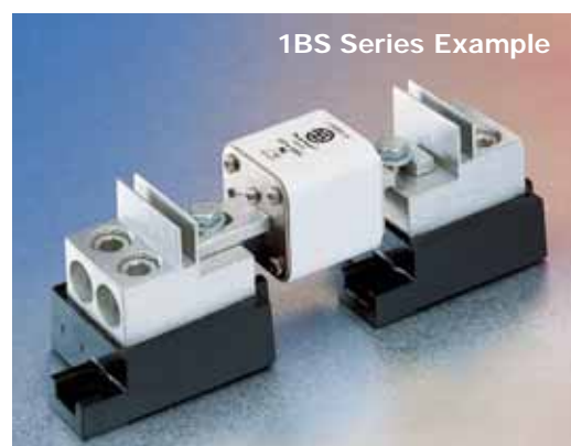
1BS Series Example